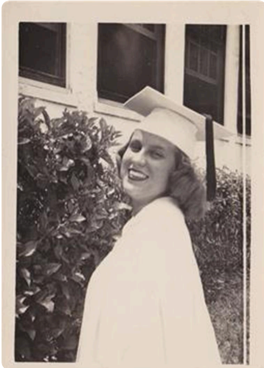
Mom on Graduation Day, Tavares High School, 1949