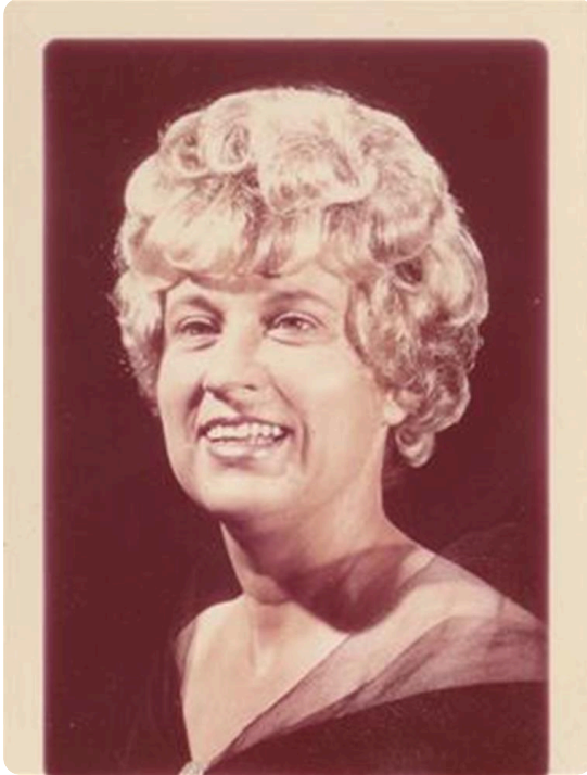
Looking good..I always loved this photo