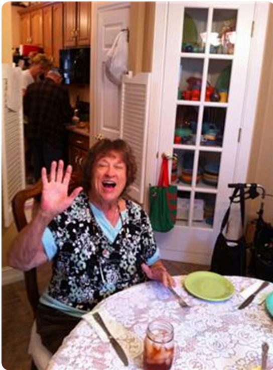
Happy Mom at Hollies House 2013