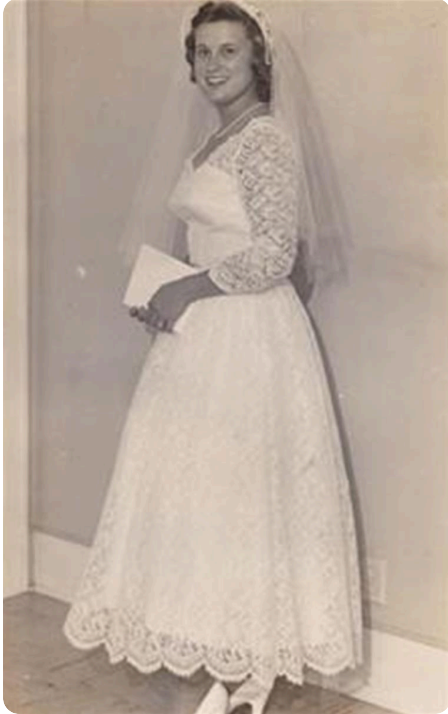
Mom on her wedding day, June 11, 1953